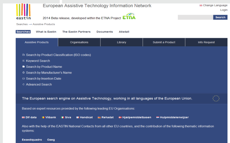
Homepage of ETNA- EASTIN 2.0